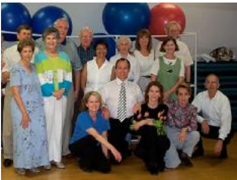
Piedmont NC USA-Dance members and friends from other chapters at an advanced Quick Step Workshop in April.