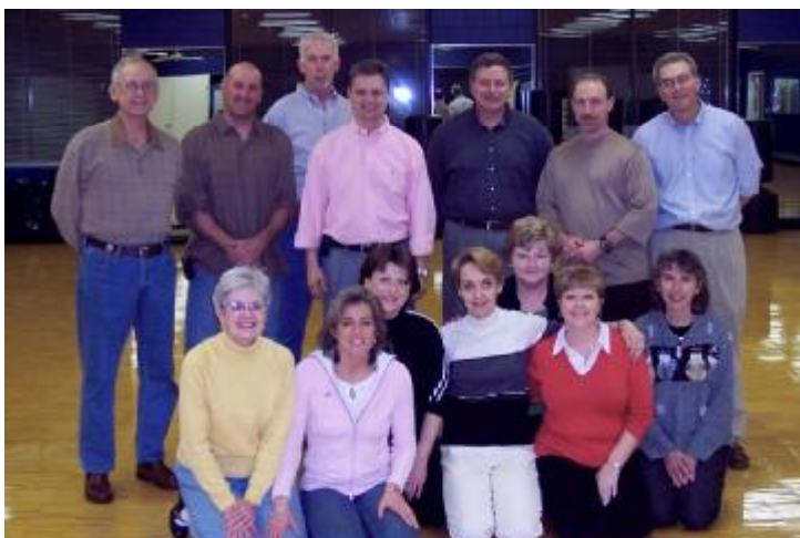
Some of the participants in our most recent Introductory Ballroom Dance Class.

-A lead is an invitation, not a demand. She's your partner, not your pet.